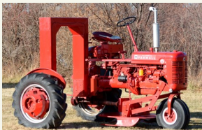
1951 Farmall Christmas Tree Tractor

There were only seven of the Farmall Christmas Tree tractors produced. They were manufactured in Canada to assist Christmas tree farmers, enabling them to mow around planted Christmas trees. This one sold in April 2018 for $16,800.