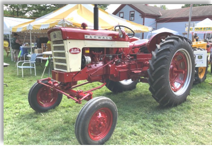
2020 Raffle Tractor—1960 Farmall 340

Our 2020 Raffle Tractor is this 1960 Farmall 340 Wide Front Row Crop tractor. As you all know, each year the Historical Engine Society conducts a