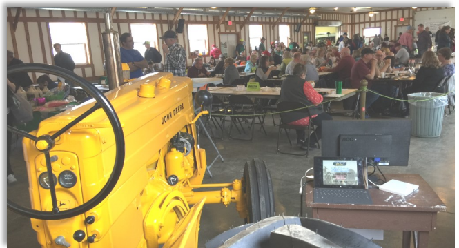
Scene from the 2019 Pancake Breakfast at Century Village Museum

Of course, you may also just come for the pancakes!