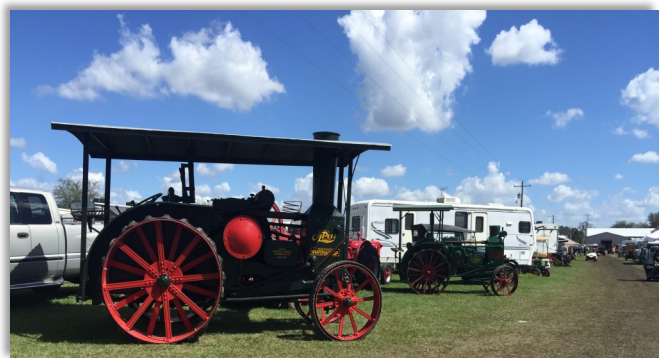
Rumely R on the left & Rumely W on the right

amount of equipment on their 374 acres. This year they featured International Harvester, Case IH, Case and New Holland. They also had the Wall of Death motorcycle thrill show where they ride 1920's Indian Scout motorcycles inside a barrel shaped wooden cylinder and ride up the vertical wall. This is a must see show!