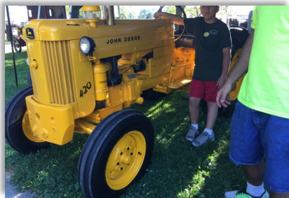
2019 Raffle Tractor—1957 John Deere 420U

Our 2019 Raffle Tractor is this stunning 1957 John Deere 420U. Yes, this tractor is supposed to be yellow! Each year the Historical Engine Society con-