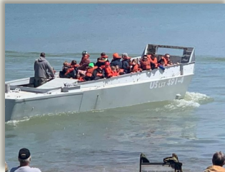
Amphibian Military Equipment Rides

to go around! Visitors were able to take a bus tour to see the sand and gravel operation and rides on amphibious military vehicles were available. There were plenty of live