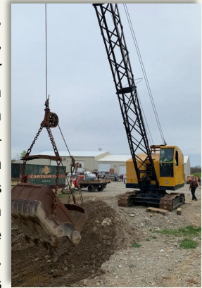
Dragline Operating at the Lakeside Sand & Gravel Open House—April 27, 2019

demonstration of cranes, shovels, draglines, dozers, trucks and a host of other equipment to see. Lunch was served for a donation and all proceeds were donated to the Hattie Larlham Foundation. Many members of HES are also involved in this event. We had the raffle tractor there selling tickets, shirts & hats. Lakeside is celebrating 65 years in business this year.