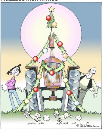
YOUR WIFE BEGINS TO HINT THAT YOU SHOULD DO SOMETHING WITH THAT OLD TRACTOR YOU HAVE PARKED DOWN IN THE TIMBER.