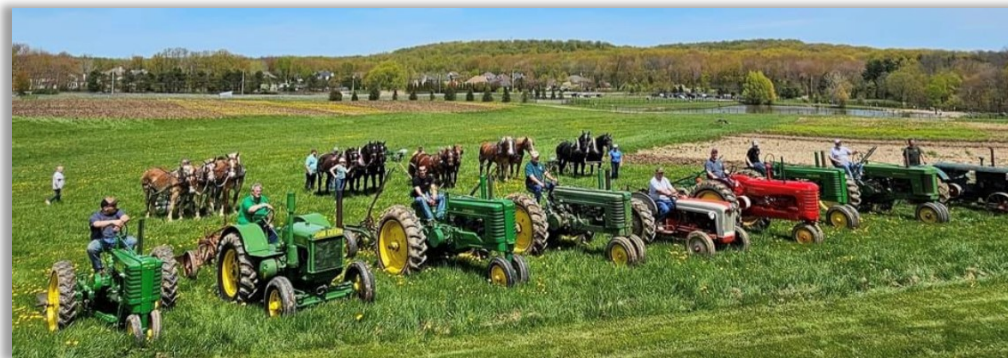
Plow Day 2023 9 - Tractors 5 - Horse Teams

Society fellowship consists in the sharing of knowledge, ideas and educational programs. Work parties, picnics and field trips make this a truly family oriented organization. The annual show is a year-round effort, culminating in a gathering of people and their machines. Visitors are treated to the sights, sounds and demonstrations of the power of the past.